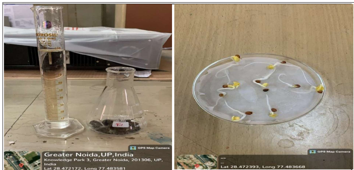
Fig. 4: Germination Index Analysis