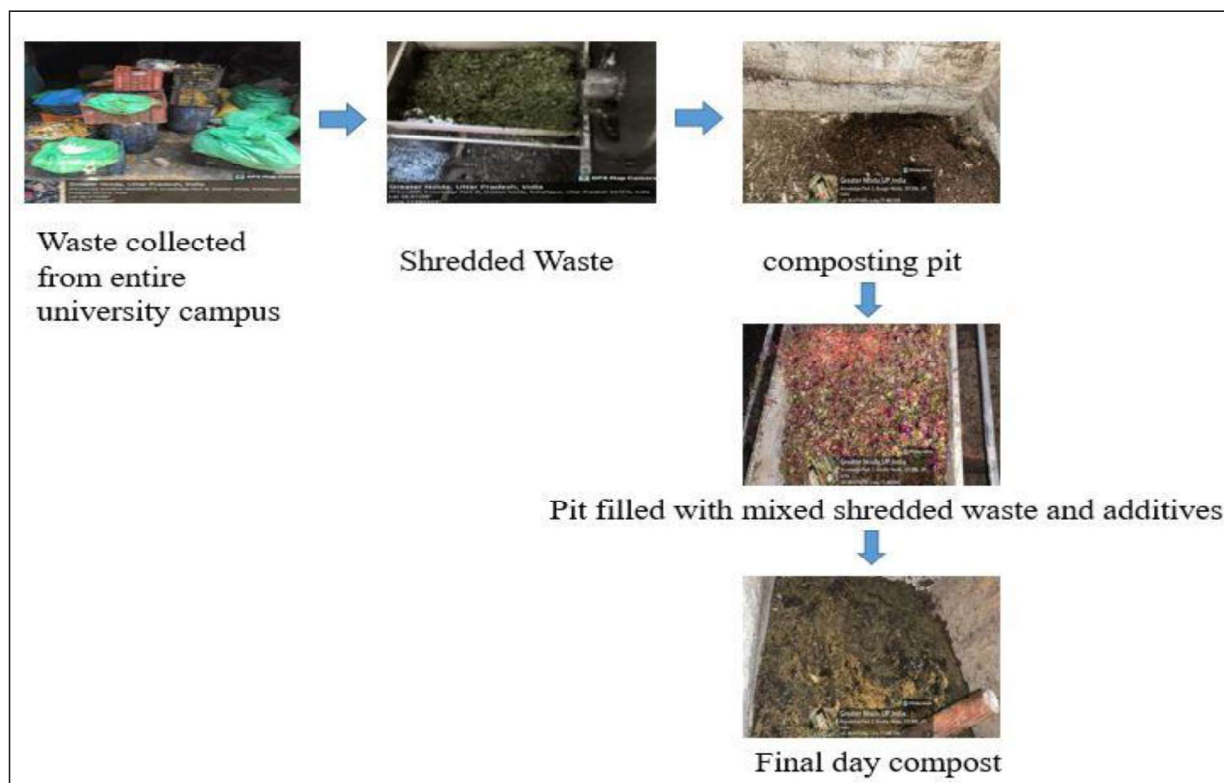
Fig. 1: Experimental Flowchart

This entire setup was kept undisturbed for 21 days while in this period all the physio-chemical parameters of the compost were analyzed at fixed intervals of time. A typical sample of approximately 500 grams of weight was taken from the top, middle, and bottom of the pit. After that sample was put in an oven at the environmental engineering lab for 24 hours at around 80 °C, then this sample was grinded in the mixer at the lab itself, further, the sample was sieved through a 0.2 mm mesh filter. Now the sample obtained was utilized for the essential parameter analysis through respective instruments present in the university. Digital thermometers were used to keep track of the temperature during the composting process. In compost pits, temperature was gauged at three points every day to keep track, and the mean temperature was recorded. The entire composting process followed at the composting plant is illustrated in Fig. 1.