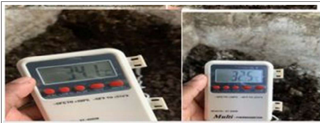
Fig. 2: Regular Temperature Detection via Probe Digital Thermometer